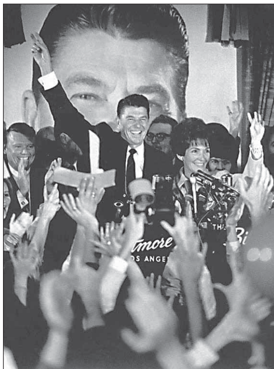
Ronald and Nancy Reagan celebrate his election as governor of California at the Biltmore Hotel in Los Angeles, November 11, 1966.

In 1966, NAREB massed its forces for an even greater accomplishment: defeating the 1966 civil rights bill, whose centerpiece, Title IV, was federal open housing legislation. Playing similar roles, but on opposite sides, realtors mobilized opposition to the bill as Martin Luther King’s Southern Christian Leadership Conference mobilized support. They stirred the grassroots. Congressmen marveled that they had never received so much mail on an issue in their lives. It poured in from the Catholic, white-ethnic southwest side of Chicago—where King was marching for open housing past heckling white crowds who threw rocks at him—to the pro-civil rights Democratic senator Paul Douglas, who was up for reelection. The messages point up just how profoundly middle-class Americans had bound up their very identities with a sense of their right to control their own neighborhoods: “As a citizen and a taxpayer I was very upset to hear about ‘TITLE IV’ of the so-called civil rights Bill S. 3296. . . We designed and built our own home and I would hate to think of being forced to sell my lovely home to anyone just because they had the money.” On August 5, 1966, Douglas, who lost reelection, received upwards of a dozen letters posted from consecutive addresses on the same street: a political block party. This was the coordinated response of a community —even, a historian might puckishly argue, if it were not for the bricks thrown at the nuns