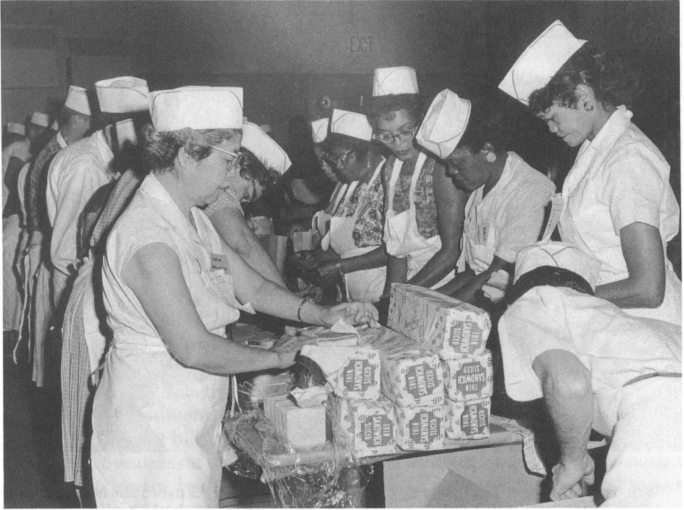
Preparation of sandwiches for the March on Washington.